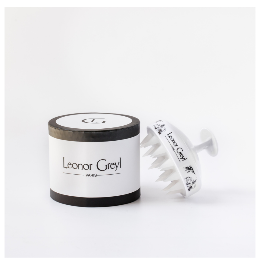
Best for sensitive scalps

"This brand has so many amazing and good-for-you products. They're the highest quality on the market," Yates says. And this massager is no exception with soft yet durable bristles that work well on both dry and wet hair. And it also gets high marks for not snagging thin strands. Then there's the fact that it feels absolutely incredible on a tired head!