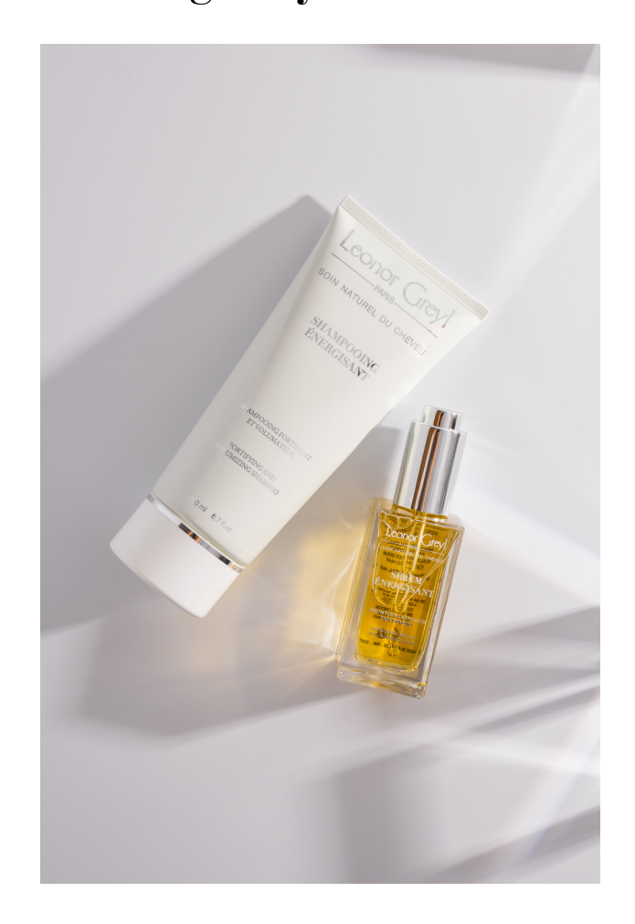
Hair Thinning Power Duo

Save your strands with this power couple, a shampoo and serum that are also sold separately but work best as a duo. Natural botanicals work to strengthen hair, balance the scalp to create a healthy environment and prevent hair fall.