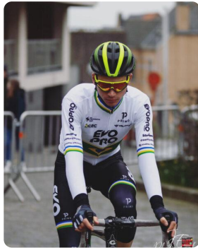
Vitor @vizucco Youngest Brazilian Pro National Road Champ