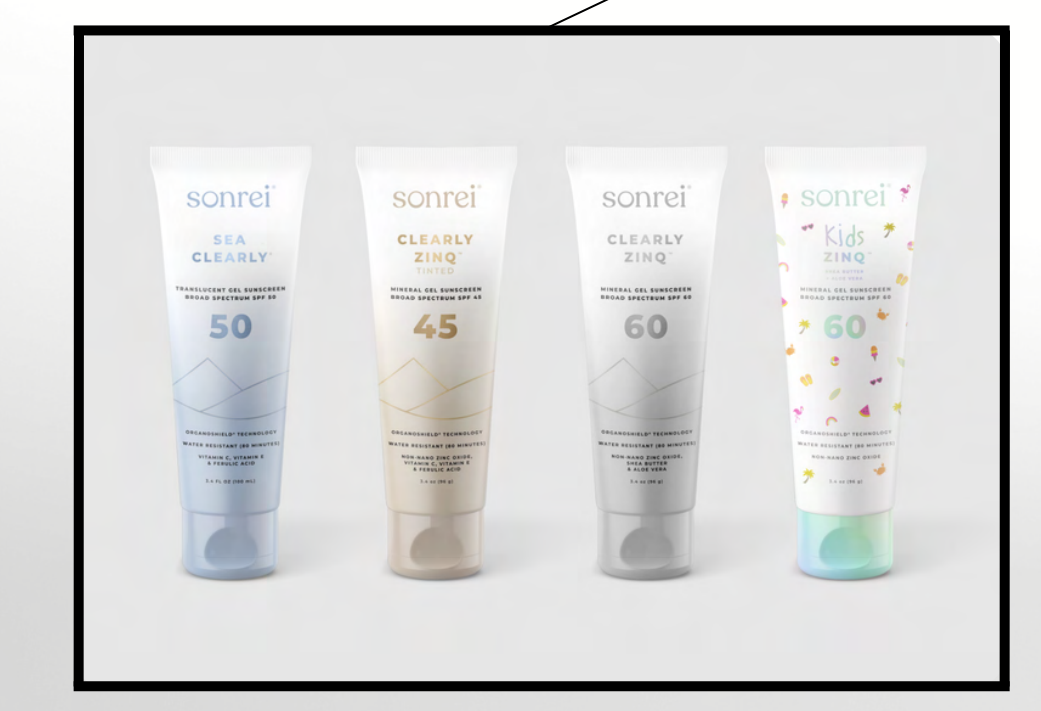
Athleisure Hydrating Gels