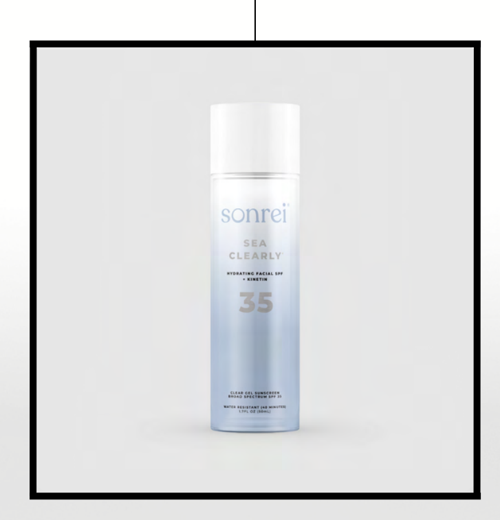
Facial SPF + Growth Factor