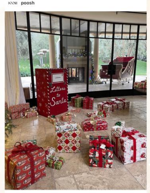
poosh The greatest gift to give yourself this year? Staying in budget. We've rounded up our favorite under $100 and under...