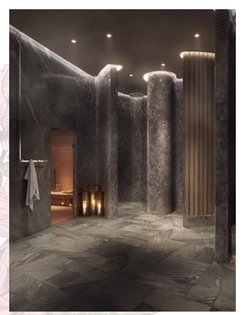
The new Fairmont Spa in century City.