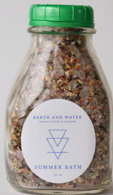
summer 16oz - $25

This Spring batch is all about renewal. Like a new plant budding up from the earth. You will feel refreshed and renewed as you submerge yourself in Spring's delight.