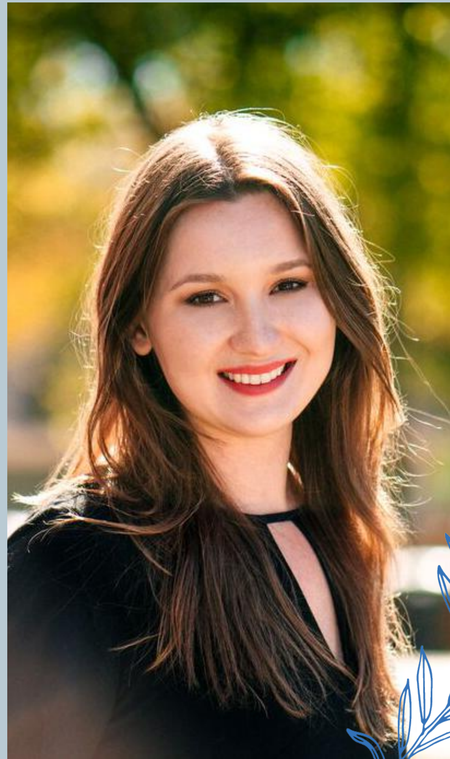
Brittany Cheek Designer / Photographer