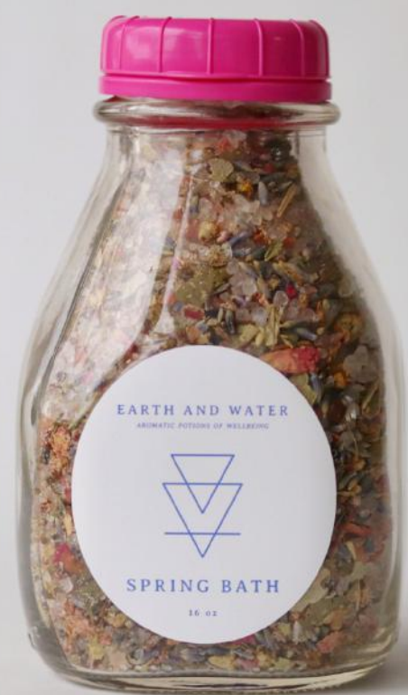
spring 16oz - $25

This Spring batch is all about renewal. Like a new plant budding up from the earth. You will feel refreshed and renewed as you submerge yourself in Spring's delight.