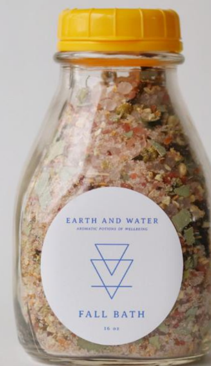
fall 16oz - $25

The summertime is about heat and movement. With that in mind, this Summer batch is intended to be used as a cooler bath, to help lower the body temperature and soothe inflamed skin. Give yourself the power to tame that fire energy and settle into your cave.