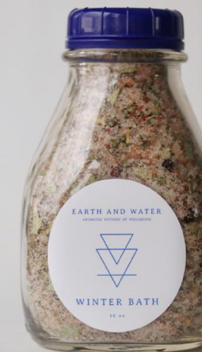
winter 16oz - $25

Falling for this spicy earth blend. Designed perfectly for the Harvest Season, to make you feel warm and cozy on those crisp cool nights.