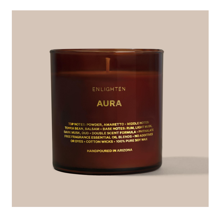
12oz Glass Tumbler Wholesale: $14 Retail: $28

To explore our complete Amber Collection, please visit www.enlightencandles.com/collections/amber